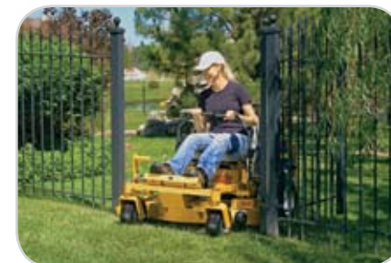
With the compact Mini Z, gates are no longer an obstacle to your riding mower.